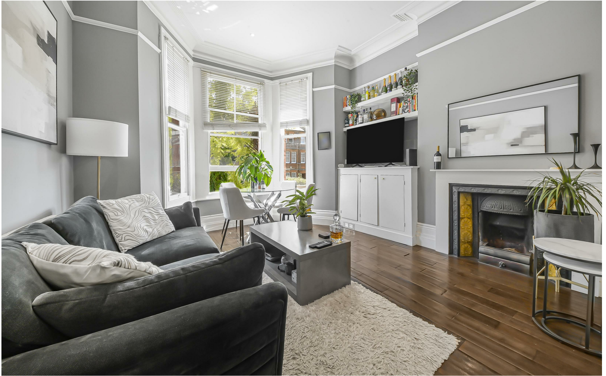
Goldhurst Terrace NW6